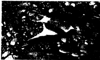
Sabine's Gull, Presque Isle S.P., Pa., Oct. 15, 1979.